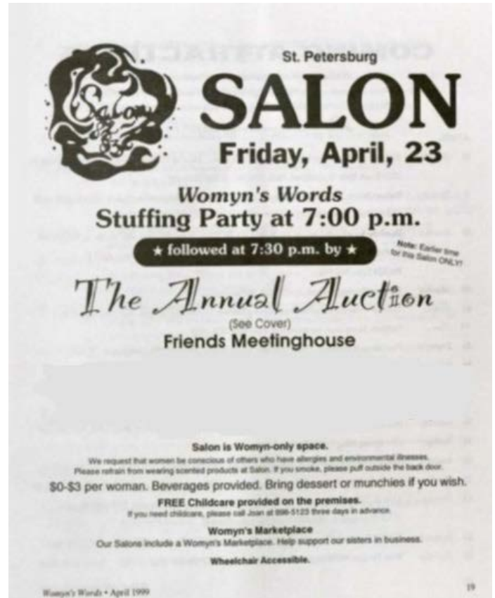
Figure 1: (WEB April 1999) Womyn's Words , including front page and ad for Salon advertisements.

The late 1990s reflect what I will call the “height” of WEB in that these issues reflected the most opportunities for in-person activities, including four Salons across three Western Florida counties and ample announcements for members to help build the community through activities like the annual auction (see Figure 1) which benefited local women in need. The late 1990s also reflected the years in which Womyn's Words contained the most pages and advertisements, signaling an interest in supporting women-owned businesses and separatism